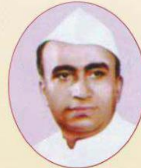
Inspiration Loknete Vyankatrao Hiray