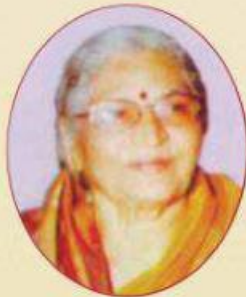
Chairperson Hon'ble Smt. Pushpatai Hiray