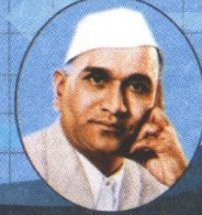
Karmaveer Bhausaheb Hiray